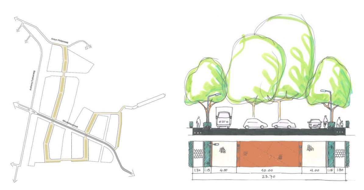
Figure 6. Access and Parking Strategy and street profile

The project involved two main land use plan (Figure 7), one for the wastewater treatment works (approved in 2010) and the other for the residential neighbourhood (approved in 2013). The latter has been revised twice on minor components in 2018 and 2019 respectively. Our main interest is in the land use plans for the residential areas.