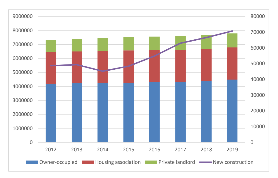
Figure 2. Dwelling stock and construction, 2000–2018.

Owner-occupied housing (including properties owned outright and on which a mortgage is payable) make up around 60% of all housing, while housing associations own around 30% of Dutch housing stock, with this figure increasing to 40% in Amsterdam and Rotterdam (Nijskens and Lohuis, 2019). Between 1945 and 1986 social housing as a proportion of total housing stock increased from 10% to a high of 46%, since when it has been in gradual decline (Elsinga and Haffner, 2020). Alongside this, owner occupation grew from 45% to 60% of total stock between 1990 and 2014 (Statistics Netherlands, 2014). The private rented sector has also undergone something of a revival, especially in the larger cities, with more than 20% of total transactions in Amsterdam between 2014 and 2019 being in the private rented rented sector (Nijskens and Lohuis, 2019).