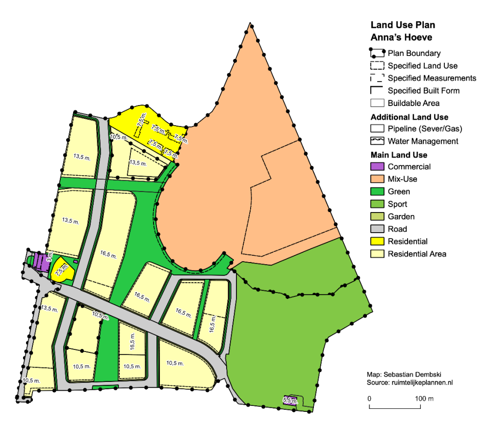
Figure 7. Land Use Plan Anna's Hoeve.

The project involved two main land use plan (Figure 7), one for the wastewater treatment works (approved in 2010) and the other for the residential neighbourhood (approved in 2013). The latter has been revised twice on minor components in 2018 and 2019 respectively. Our main interest is in the land use plans for the residential areas.