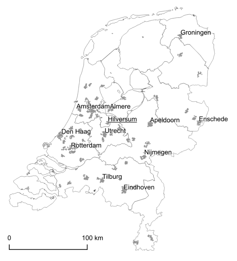
Sebastian Dembski. Source: BRT, CC-BY-4.0 Kadaster

Figure 1: Spatial structure of the Netherlands with main cities and exemplary case study (underlined).