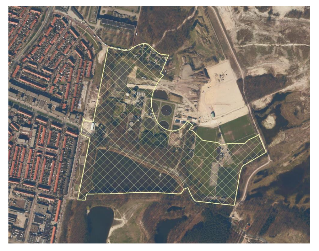
Figure 3. Aerial view of the site before planning and boundaries of the plan (Gemeente Hilversum, 2012).

Anna's Hoeve is an urban development project in the fringe of the town of Hilversum, which is located between the cities of Amsterdam and Utrecht. With an area of 13 hectares and approx. 550 dwellings, it is one of the largest residential development areas in Hilversum. The site became available when the Water Board through the replacement of a wastewater treatment works by a modern installation which required less space. Anna's Hoeve is therefore not a greenfield site development despite its situation in the urban fringe (Figure 3). The site has a long history, but the focus will be on the development of the current project in delivering affordable and commercial housing in an attractive estate.