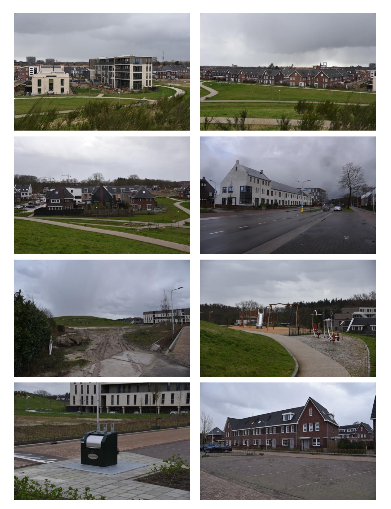
Figure 8. 15 flats and 8 homes realised by a collective with communal garden (top left); 38 social-rental single family homes (top right); 6 single family homes realised on individual plots (second row left); 33 owner-occupied single family homes (second row right); soil heap (third row left); pleasantly designed playground on the soil heap (third row right); underground bin containers (bottom left); high-quality permeable paving of residential roads and parking (bottom right)